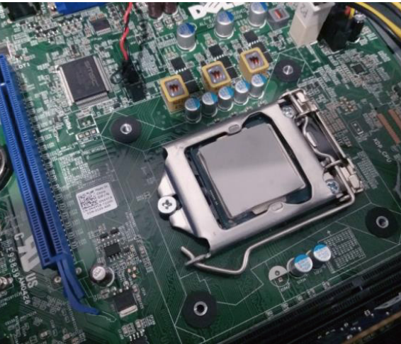
Max 33% dissipation optimization

Thermal conductive interfaces, which have received over 10 patents, increase thermal conductivity by 33% and cooling performance by 16%, assuring product stability and competitiveness.