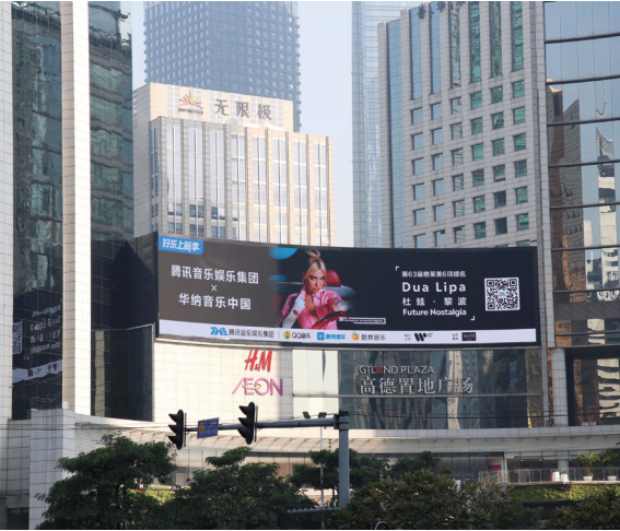
10000nits ultra high brightness

Customized LEDs for superior brightness to maintain visibility in high ambient light conditions. It accurately outputs more lifelike and realistic images even under the glorious sunshine,